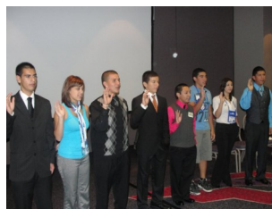
Board members take oath to honor the LULAC code at their swearing in ceremony.

recently created a group on Facebook called LULAC YOUTH DIRECTORY. It is a group where the youth input their contact information and can view