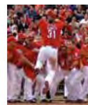
LULAC President's Celebration at the Great American Ball Park