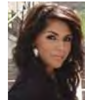
Melissa "Crash" Barrera of Mun2 Actress