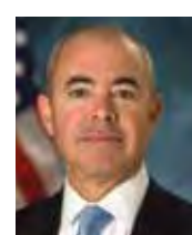
Alejandro Mayorkas Director, US Citizenship & Immigration Services