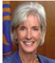
Kathleen Sebelius Secretary, U.S. Department of Health and Human Services