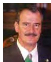
Vicente Fox Former President of Mexico