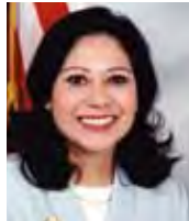
Hilda Solís Secretary, U.S. Department of Labor