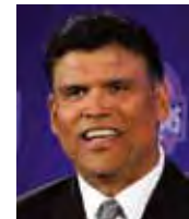
Anthony Munoz, "NFL Hall of Fame" Legend