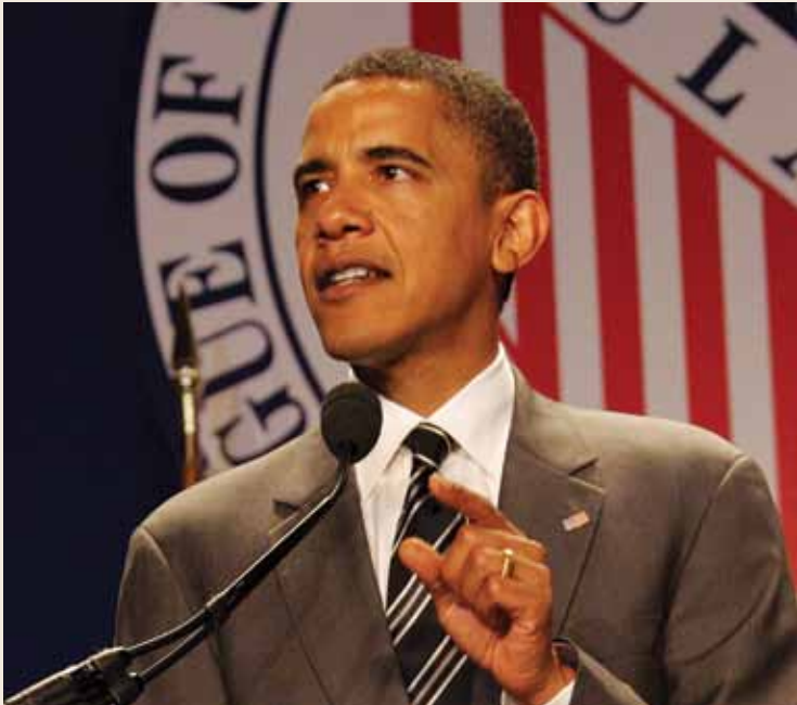
President Barak Obama speaks at the 2008 convention.