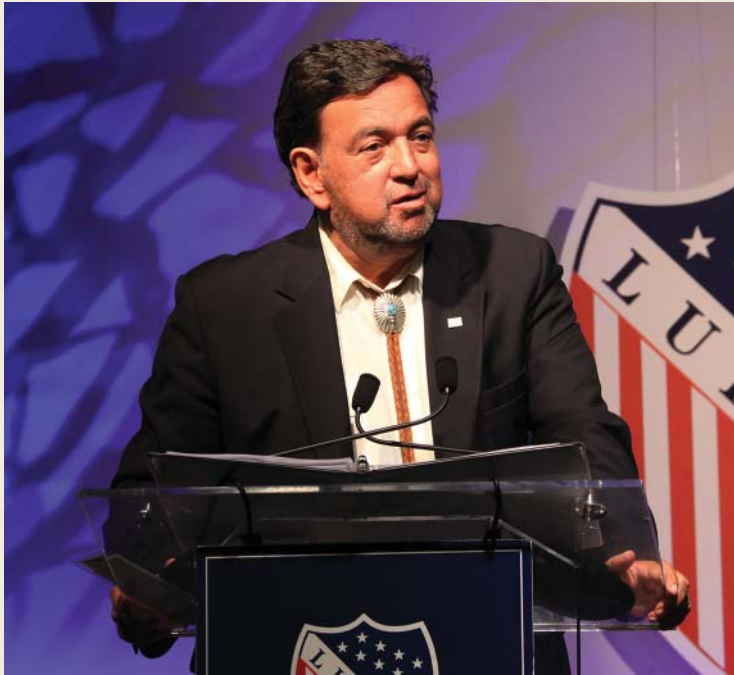
New Mexico Governor Bill Richardson speaks at the 2010 convention.