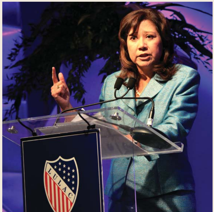
ABOVE: Ozomatli performs at the Concierto de la Gente in Albuquerque. BELOW: Labor Secretary Hilda Solis speaks at the 2010 convention.